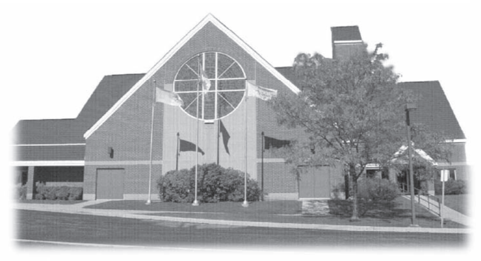
"... The seed is sprouting and growing ..." (Mark 4:27)

ST. VINCENT DE PAUL: White Box Collection on the last Sunday of the month. Call 519-571-8485 for information on food distribution.